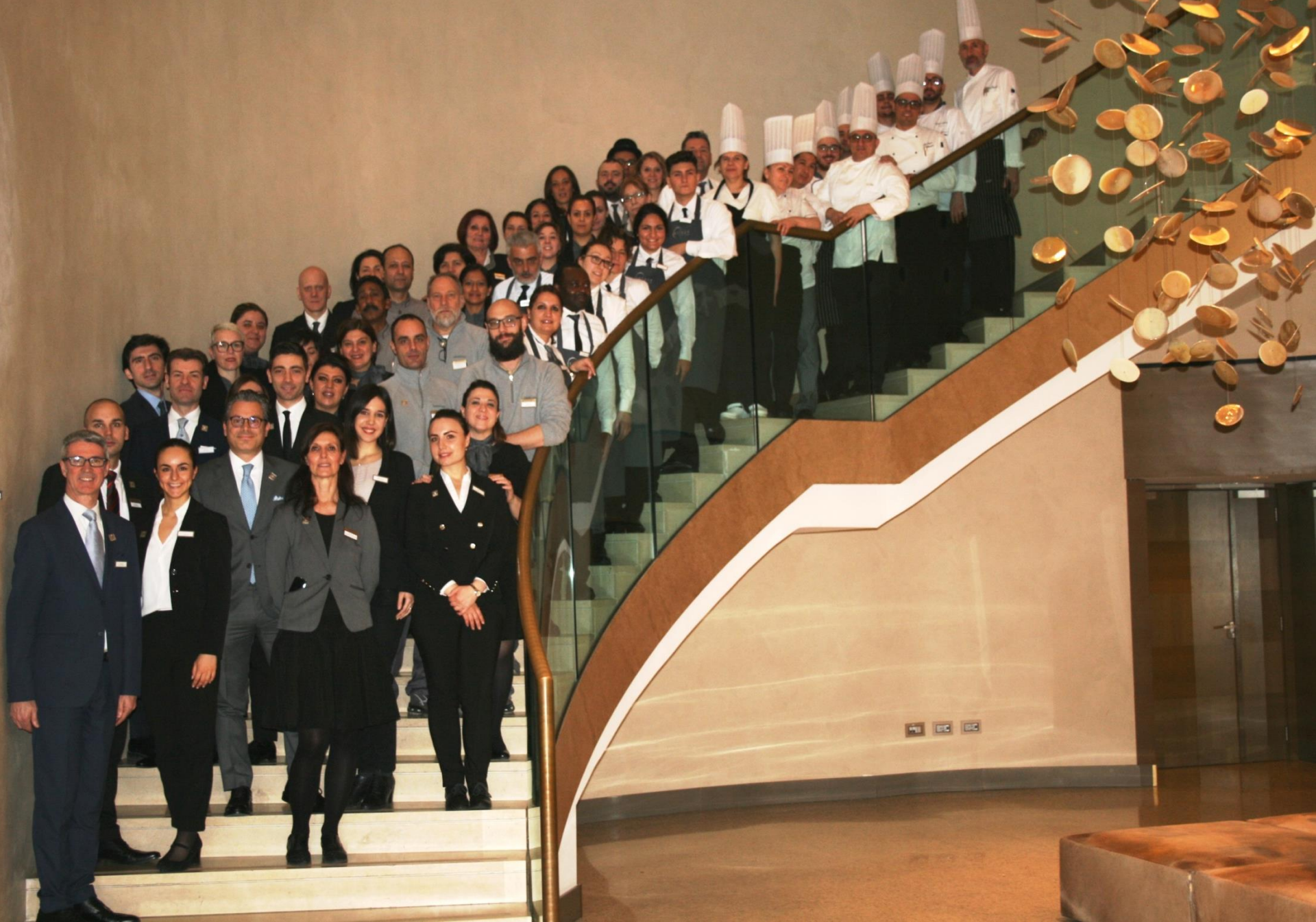
Milano, Rosa Grand – The Team